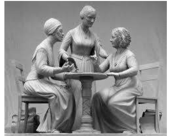
Women's Suffrage Statue in Central Park, New York

By the time this newsletter is delivered, Dangerous Dames of Dayton 2020 will be just a few days away. This year we celebrate the 100th anniversary of the 19th Amendment and all its promises to provide women with equal voting rights by stating, “the right of citizens to vote shall not be denied or abridged by the United States or any State on account of sex.”